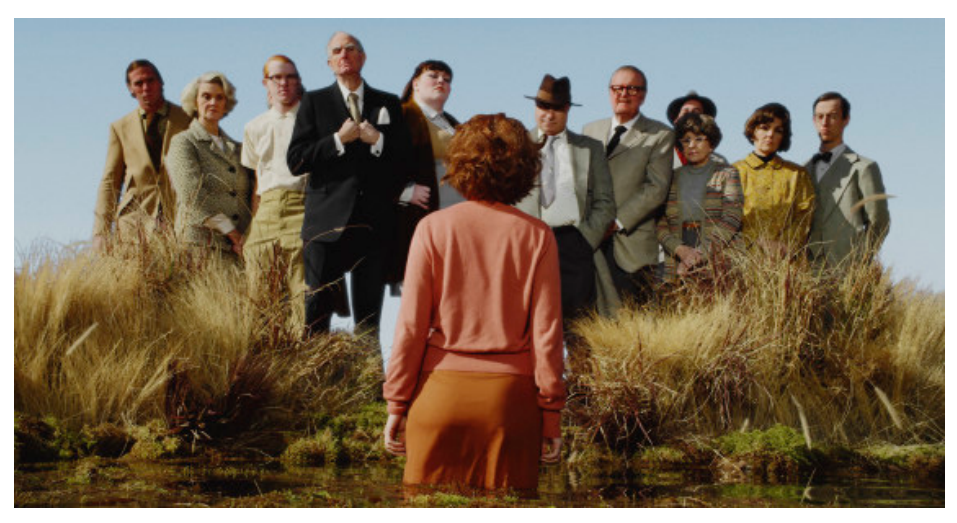
La Petite Mort