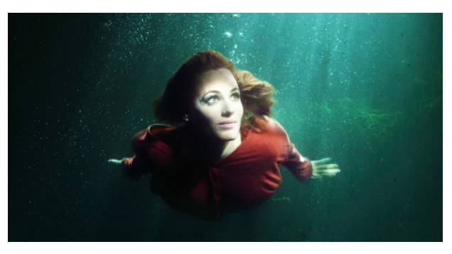
Alex Prager, La Petite Mort

Some captured and later distorted documentation of historic events, while others explored the limits of the newly employed medium -- the guidelines of the ever-evolving technique was anything but fixed. In a somewhat rare occurrence for the sadly male-centric history of art, woman artists were pioneers of video art from the very beginning. While the histories of painting and sculpture often omit the female forces from the books, the chronological lateness of video art made way for a far greater female influence.