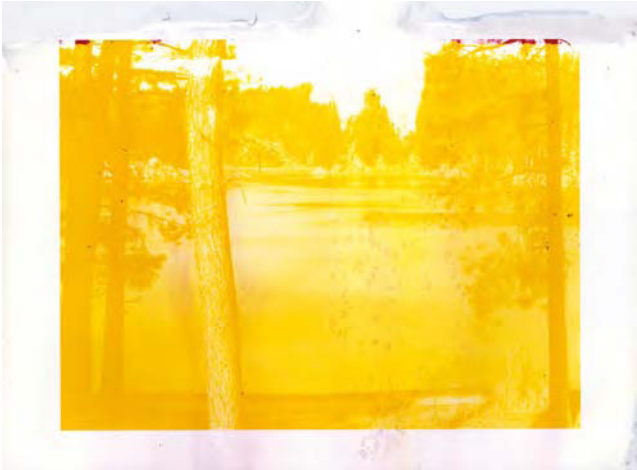
Horse Thief Lake, WA 1, 2008 (C-print soaked in Horse Thief Lake water, 16 x 20", unique)