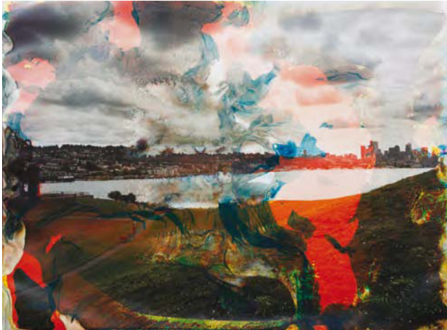
Lake Union, WA 4, 2010 (C-print soaked in Lake Union water, 30 x 40", unique)