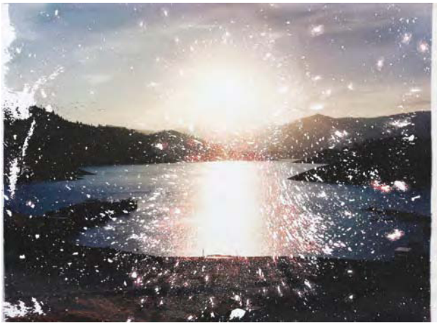
Shasta Lake, CA 4, 2010 (C-print soaked in Shasta Lake water, 30 x 40", unique)