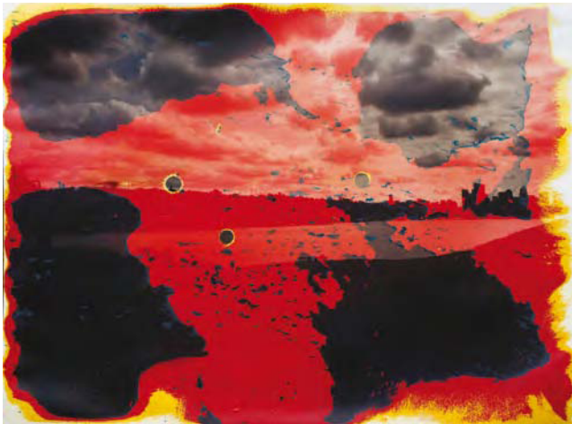
Lake Union, WA 6, 2010 (C-print soaked in Lake Union water, 30 x 40", unique)