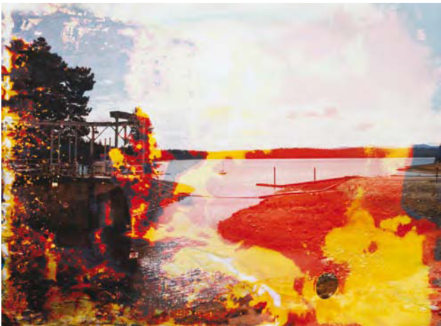
Crescent Lake, WA 2, 2010 (C-print soaked in Crescent Lake water signed, 30 x 40", unique)