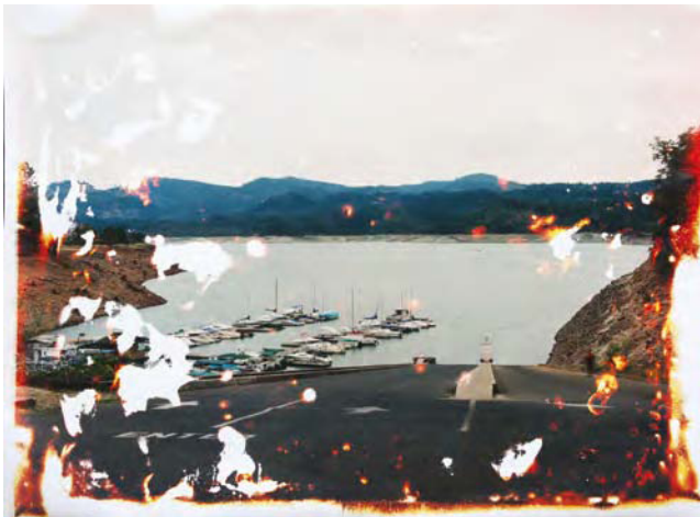
O'Dell Lake, O R 3, 2009 (C-print soaked in O'Dell Lake water signed, 30 x 40", unique)